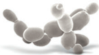
Saccharomyces cerevisiae yeast (Lallemand Group)

An excessive deficit of water will reduce the physiological activity of the vine, and may even reach limits which do not allow the recovery of the photosynthetic system of the leaf, producing an early senescence and abscission, which will lead to a worse ripening of the bunches, an increase in their direct exposure to solar radiation and a lower accumulation of reserve substances in the plant. LalVigne PROHYDRO , applied preventively to water stress conditions, will improve vine adaptation and resistance to excessive water deficit and will increase its recovery after periods of water stress.