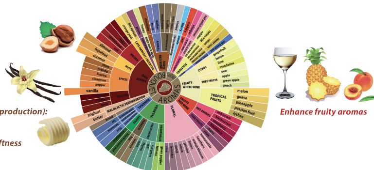
Diacetyl production - Chardonnay wine

Beyond bio-deacification, LALVIN MCBB™, Malolactic Culture Butter Bomb, is the perfect tool to produce traditional and complex well-balanced buttery driven white wines, with an easy-to-use protocol (direct inoculation without any rehydration step).